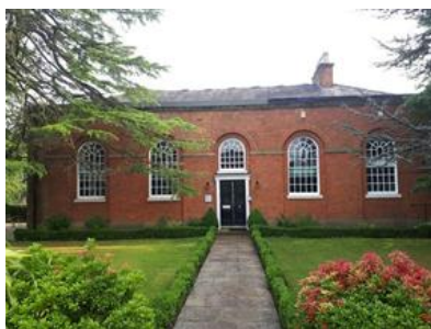
The Quaker Meeting House